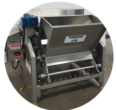
Optional bulk loader/hopper